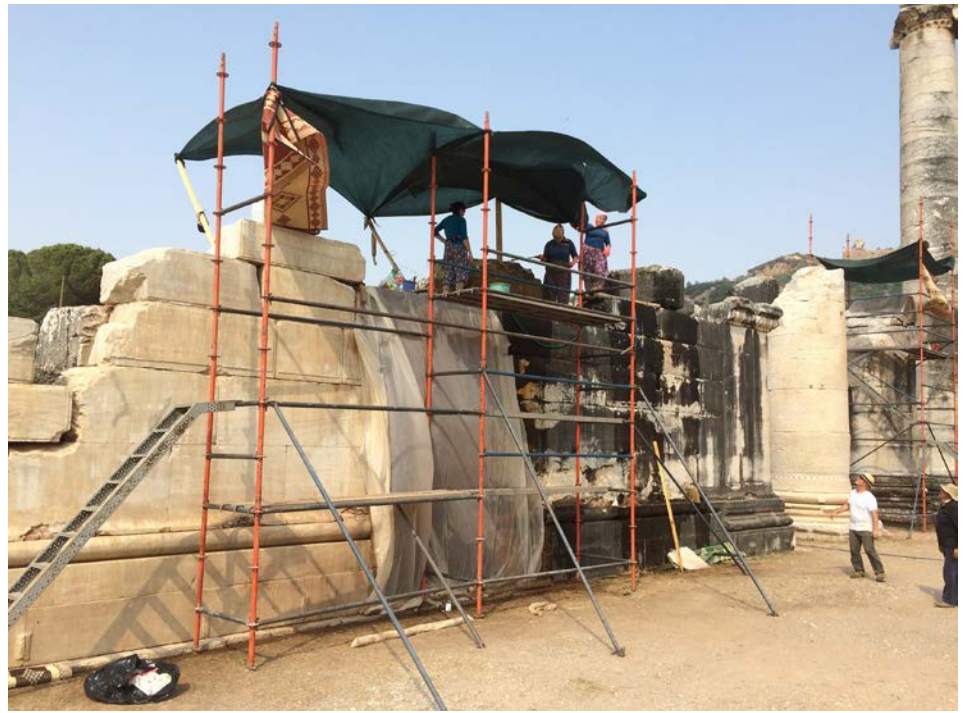
Figs. 23 & 24. Three teams of village women continue to clean the temple of Artemis, some working on the columns, others on the massive walls. The work on scaffolding in the hot sun is demanding, but they are incredibly able and committed and have made great progress, transforming the blackened walls and columns into gleaming white, and revealing features not seen since Butler's day.

This is the third year of our five-year effort, supported by the JM Kaplan Fund, to remove the lichen and biofilm from the temple of Artemis, and the experienced team of local women now completely owns the project (figs. 23-26). Conservators Michael Morris (The Metropolitan Museum of Art) and Hiroko Kariya (private practice) oversee and clean the more challenging areas themselves, but the women take on more and more responsibility, assembling