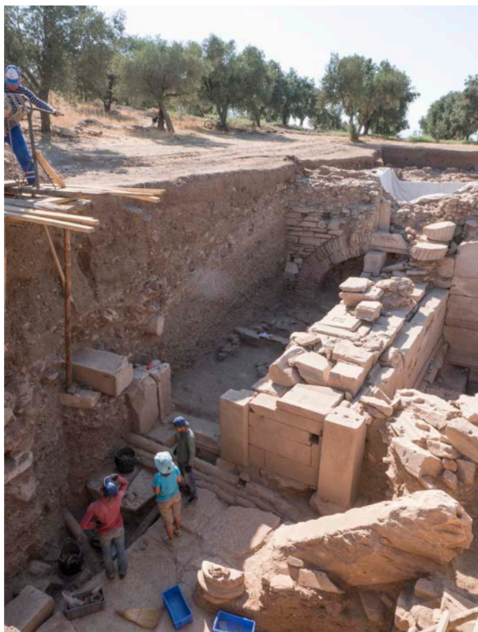
Fig. 11. Lauren and her workmen stand on the pavement of her newly-discovered road and possible gate. The “spolia wall” behind them ends neatly, framed by reused inscriptions. The massive toppled block in the lower right is another reused inscription, with a cutting on one corner which Baha realized was to hold a wooden framework. The square hole in the butt end of the spolia wall received the bar to close the gate.