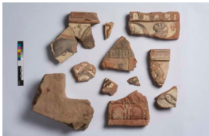
Fig. 3. Architectural terracotta revetments from Field 49, including the one depicting a chariot found by Güzin this year (in upper left). To its right is the snake decoration from the chariot of another such revetment, and in the center and lower right, a charioteer and a dog from other plaques and two tiny fragments of hooves, these running the opposite direction. These plaques presumably all decorated a single building on this hill in the sixth century BC, but the fragments were found scattered widely after the area was systematically demolished.

But her most interesting find of the summer is a mass of iron scales from an armor corselet. She has been finding individual scales and small groups in this trench for some years now, but this year's haul produced more than 1200 scales, including one clump of about 400 small scales still corroded together in their original arrangement (figs. 5-6). The scales were crafted in different sizes and shapes to fit different parts of the body, and were probably sewn to a shirt of cloth or leather. Such corselets are seen in Assyrian and Egyptian reliefs, and examples have been found at Near Eastern sites (fig. 7). Such individually-crafted suits of armor would have been specialty items belonging only to the elite troops or to the central palace. Most