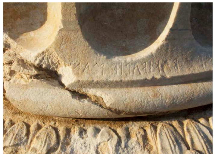
Figs. 25 & 26. This inscription in the Lydian language on one of the pedestaled columns was hardly legible under the lichen; now we can again read something to the effect that the column was dedicated by Manes (Lydian equivalent of Joe), the son of Bakivaś (a theophoric name related to Bacchus, or Dionysus, god of wine and a native of Lydia).