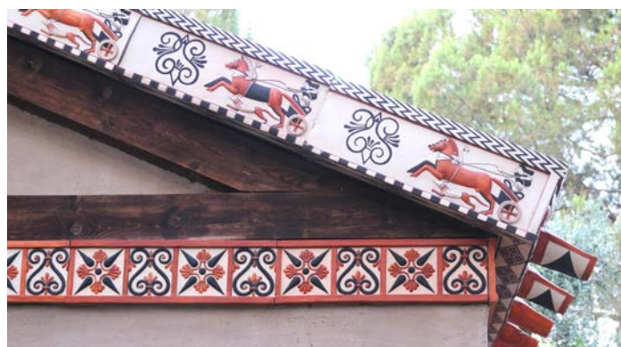
Fig. 4. The Lydian Building Reconstruction built in the 1970s and 1980s incorporated tiles depicting such chariots, based on ancient examples.

of the armor was found in this enigmatic Achaemenid fill; but is it a Persian corselet, or a Lydian one dumped here with the other detritus? We're still not sure.