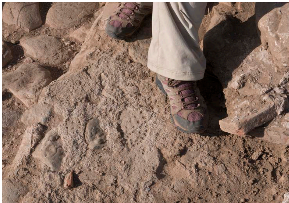
Fig. 8. Erin Lawrence found the footprints of at least two people wearing hobnail boots in the mortar of the early Roman terrace. She writes in her report: "one individual's footprint is a woman's size eight, while the other would wear a dainty child's size nine."