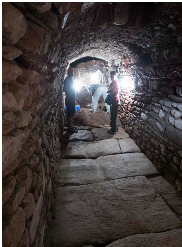
Fig. 17. Hakan Aycan and government representative Necla Okan in the “Synagogue drain.” Too broad and tall for even a Roman drain (and not connected to any waterworks in the Bath), it may have been built as a passageway. The wheel ruts visible in the pavement belong to an earlier use of those blocks, as the ruts don't line up and some run crosswise.

of the “Touristic Enhancement Project” to protect, clarify, and open to visitors the area around the Synagogue and the Lydian Gate and Fortification. Another excavation related to this project was nearby in the “drain” under the Synagogue, which we wish to reuse to carry away rainwater from the Synagogue roof when it is built. Hakan Aycan (Aegean University) took on this difficult (but blessedly dark and cool) project, and he cleared the stretch under the building. This too proved to be unexpectedly interesting: the “drain” is enormous, almost 8 feet high and almost 6 feet wide, well-built with a stone floor (fig. 17). This is too big for a drain, and there are no inlets in the original construction. Rather, it might have been built as a cryptoporticus, an underground passageway for pedestrian