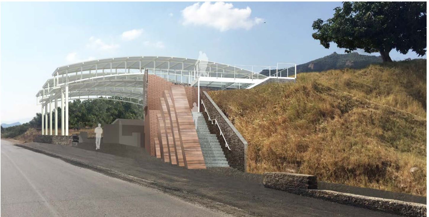
Fig. 28. Max's computer rendering of the Lydian Fortification by the highway shows the protective “dancing” roofs, the rammed-earth structure that will protect the soft earthen glacis (seen here in a very oblique view) and incorporate a staircase leading to the top of the mound, the platform on top of the fortification with its glass panel to reveal the original structure, and modern mudbrick structures that will protect the original mudbrick of the fortification.

Taner Kurtuluş (Artabel Engineering, Izmir), who is producing the final construction drawings (fig. 27). Just as challenging, though, is how to protect the soft mudbrick wall, glacis, and other earthen features that make up the fortification. The architects, engineers, and conservators have designed a system for protecting the fortification with a thin face of new mudbrick, and the glacis with a rammed earth structure which reproduces the original sloping layers, and encloses a staircase leading up to an observation platform on top of the wall, complete with glass floors to view the remains below (fig. 28). It is a complicated and finicky project, but we are approaching the end and hope to begin to build soon.