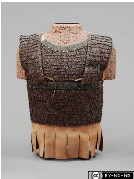
Fig. 7. Our fragments originally belonged to a corselet of iron scale armor like this one, found at Idalion on Cyprus, and made from about 6800 scales.

walls, Hellenistic walls and robbers' trenches, and perhaps some of the early Lydian boulder wall, all within a meter or so of modern ground level (fig. 8). This provides very important information about the natural topography of the hill, and how much the Lydians and later cultures had to work to transform it into its current flat-topped plateau.